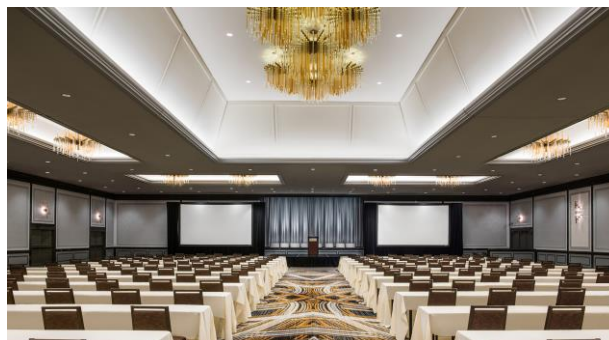
Figure 2. Photograph of the Grand Ballroom, where exhibits will take place.